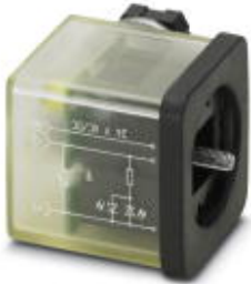
Valve connector, 3-pos., type A, 1 LED, with protective circuit, screw connection, cable screw connection M16

Please be informed that the data shown in this PDF Document is generated from our Online Catalog. Please find the complete data in the user's documentation. Our General Terms of Use for Downloads are valid ( http://download.phoenixcontact.com )