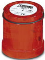
Flashing beacon element, 24 V DC, red, Xenon flash tube

Please be informed that the data shown in this PDF Document is generated from our Online Catalog. Please find the complete data in the user's documentation. Our General Terms of Use for Downloads are valid ( http://phoenixcontact.com/download )