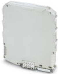
Electronic housing, design width 12.5 mm, 3 connection levels per side, for DIN rail bus connectors

Please be informed that the data shown in this PDF Document is generated from our Online Catalog. Please find the complete data in the user's documentation. Our General Terms of Use for Downloads are valid ( http://download.phoenixcontact.com )