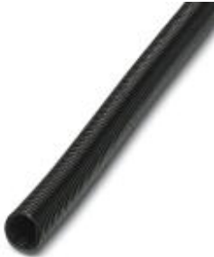
Polyamide protective hose, inflammability class V0, UV resistant

Please be informed that the data shown in this PDF Document is generated from our Online Catalog. Please find the complete data in the user's documentation. Our General Terms of Use for Downloads are valid ( http://phoenixcontact.com/download )