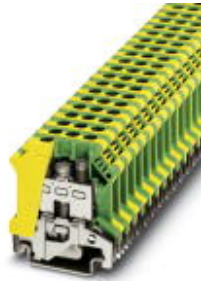
Ground terminal block with screw connection, cross section: 0.5 - 6 mm 2 , AWG: 20 - 8, width: 8.2 mm, color: green-yellow

Please be informed that the data shown in this PDF Document is generated from our Online Catalog. Please find the complete data in the user's documentation. Our General Terms of Use for Downloads are valid ( http://download.phoenixcontact.com )