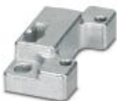
Panel mounting flange for HEAVYCON ADVANCE TMB housing with bayonet locking