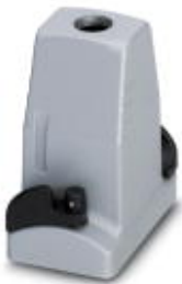
HEAVYCON ADVANCE EMV sleeve housing B6, with bayonet locking, height 100 mm, with 1x M20 thread, straight cable outlet

Please be informed that the data shown in this PDF Document is generated from our Online Catalog. Please find the complete data in the user's documentation. Our General Terms of Use for Downloads are valid ( http://download.phoenixcontact.com )