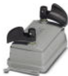
HEAVYCON ADVANCE IP65 protective cover B6, with bayonet locking, with retaining cord, diameter of retaining cord eyelet 3 mm

Protective covers - HC-B 6-TMB-SD-IP65 - 1690930