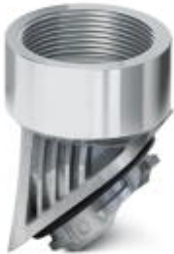
Adapter, aluminum, for EVO housing, Pg 16 thread

Please be informed that the data shown in this PDF Document is generated from our Online Catalog. Please find the complete data in the user's documentation. Our General Terms of Use for Downloads are valid ( http://phoenixcontact.com/download )