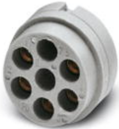
Contact insert, Number of positions: 7, Type of contact: Male connector, Crimp connection

Please be informed that the data shown in this PDF Document is generated from our Online Catalog. Please find the complete data in the user's documentation. Our General Terms of Use for Downloads are valid ( http://phoenixcontact.com/download )