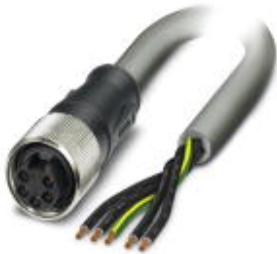
Power cable, 5-pos., gray PUR/PVC, 2.5 mm 2 , free cable end to straight 7/8" 16UNF socket, length: 5.0 m

Please be informed that the data shown in this PDF Document is generated from our Online Catalog. Please find the complete data in the user's documentation. Our General Terms of Use for Downloads are valid ( http://download.phoenixcontact.com )