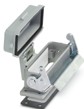
HEAVYCON panel mounting base D25, with single locking latch, height 26 mm, with cover

Please be informed that the data shown in this PDF Document is generated from our Online Catalog. Please find the complete data in the user's documentation. Our General Terms of Use for Downloads are valid ( http://phoenixcontact.com/download )