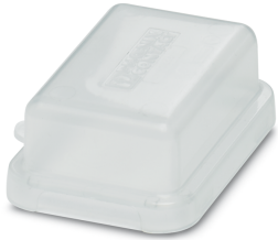
Protective cover, type: B6, degree of protection: IP20

Please be informed that the data shown in this PDF Document is generated from our Online Catalog. Please find the complete data in the user's documentation. Our General Terms of Use for Downloads are valid ( http://phoenixcontact.com/download )