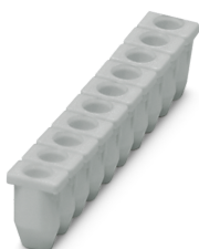
Insulating sleeve, color: gray

Please be informed that the data shown in this PDF Document is generated from our Online Catalog. Please find the complete data in the user's documentation. Our General Terms of Use for Downloads are valid ( http://phoenixcontact.com/download )