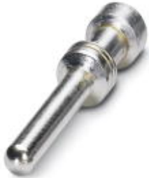
Turned 2.5 crimp contact, individual male contact, core diameter 3.00 mm 2 , silver-plated

Please be informed that the data shown in this PDF Document is generated from our Online Catalog. Please find the complete data in the user's documentation. Our General Terms of Use for Downloads are valid ( http://phoenixcontact.com/download )