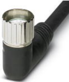
Socket M23, 19-pos., angled, shielded, with shielded, connected master cable, length: 10 m

Please be informed that the data shown in this PDF Document is generated from our Online Catalog. Please find the complete data in the user's documentation. Our General Terms of Use for Downloads are valid ( http://download.phoenixcontact.com )