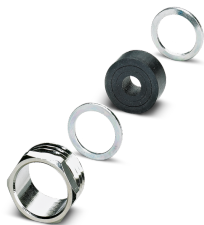
Cable gland, shielded: no, cable diameter range: 8 mm ... 12 mm, series: RC

Please be informed that the data shown in this PDF Document is generated from our Online Catalog. Please find the complete data in the user's documentation. Our General Terms of Use for Downloads are valid ( http://phoenixcontact.com/download )