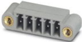
The figure shows the 5-pos. version of the product in gray

Header, Nominal current: 8 A, Rated voltage (III/2): 160 V, Number of positions: 15, Pitch: 3.5 mm, Color: black, Contact surface: Tin, Mounting: Wave soldering