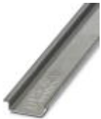
DIN rail, unperforated, Width: 35 mm, Height: 7.5 mm, Length: 2000 mm, Color: silver

DIN rail, unperforated - NS 35/ 7,5 AL UNPERF 2000MM - 0801704