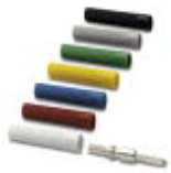
Insulating sleeve, Color: red