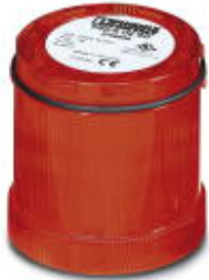
Permanent light element, 12 to 240 V AC/DC, red, without bulb

Please be informed that the data shown in this PDF Document is generated from our Online Catalog. Please find the complete data in the user's documentation. Our General Terms of Use for Downloads are valid ( http://phoenixcontact.com/download )