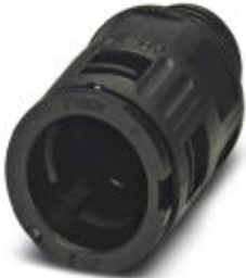
Cable gland, Pg thread, IP66 protection, straight

Please be informed that the data shown in this PDF Document is generated from our Online Catalog. Please find the complete data in the user's documentation. Our General Terms of Use for Downloads are valid ( http://phoenixcontact.com/download )