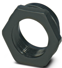
Reducing adapter, material: Polyamide fiberglass reinforced, connecting thread: M40 x 1.5, color: black, with flat gasket

Please be informed that the data shown in this PDF Document is generated from our Online Catalog. Please find the complete data in the user's documentation. Our General Terms of Use for Downloads are valid ( http://phoenixcontact.com/download )