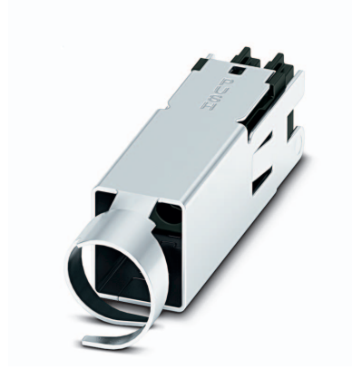
The figure shows a 2-pos. version with 4 contacts