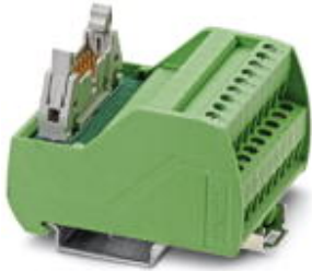
VARIOFACE interface module, for 8 channels, each with an additional terminal block per signal for a common minus potential

Please be informed that the data shown in this PDF Document is generated from our Online Catalog. Please find the complete data in the user's documentation. Our General Terms of Use for Downloads are valid ( http://phoenixcontact.com/download )