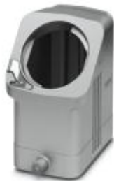
HEAVYCON EVO sleeve housing, EMC version, without powder coating, with bayonet flange for EVO screw connection, B10, for single locking latch, height: 80 mm, without EVO screw connection.

Please be informed that the data shown in this PDF Document is generated from our Online Catalog. Please find the complete data in the user's documentation. Our General Terms of Use for Downloads are valid ( http://phoenixcontact.com/download )