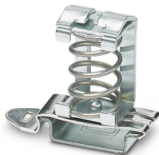
Shield connection terminal block, for applying the shield to busbars

Please be informed that the data shown in this PDF Document is generated from our Online Catalog. Please find the complete data in the user's documentation. Our General Terms of Use for Downloads are valid ( http://phoenixcontact.com/download )