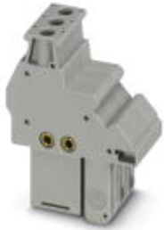
Plug, 3-pos. with integrated, automatic short circuit function

Please be informed that the data shown in this PDF Document is generated from our Online Catalog. Please find the complete data in the user's documentation. Our General Terms of Use for Downloads are valid ( http://download.phoenixcontact.com )