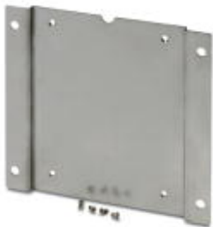
Mounting plate for FL SWITCH 30... and FL SWITCH 40... eight-port switches

Please be informed that the data shown in this PDF Document is generated from our Online Catalog. Please find the complete data in the user's documentation. Our General Terms of Use for Downloads are valid ( http://phoenixcontact.com/download )