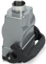
HEAVYCON B10 coupling housing, with single locking latch, height: 77.5 mm, with 1 x Pg21 gland, straight cable outlet

Please be informed that the data shown in this PDF Document is generated from our Online Catalog. Please find the complete data in the user's documentation. Our General Terms of Use for Downloads are valid ( http://phoenixcontact.com/download )