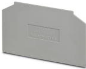
Partition plate, Length: 69 mm, Width: 1.5 mm, Height: 57 mm, Color: gray

Please be informed that the data shown in this PDF Document is generated from our Online Catalog. Please find the complete data in the user's documentation. Our General Terms of Use for Downloads are valid ( http://download.phoenixcontact.com )