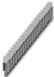
Fixed bridge, Number of positions: 20, Color: silver

Please be informed that the data shown in this PDF Document is generated from our Online Catalog. Please find the complete data in the user's documentation. Our General Terms of Use for Downloads are valid ( http://download.phoenixcontact.com )