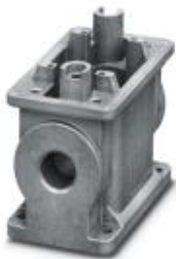
HEAVYCON ADVANCE B6 basic housing without screw openings, for M6 screw locking, salt-water-resistant aluminum, without surface coating

Please be informed that the data shown in this PDF Document is generated from our Online Catalog. Please find the complete data in the user's documentation. Our General Terms of Use for Downloads are valid ( http://download.phoenixcontact.com )