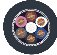
PUR halogen-free black shielded [PUR]