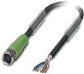
Sensor/Actuator cable, 6-position, PUR halogen-free, Black-gray RAL 7021, shielded, Free cable end, on Socket straight M8, Cable length: 10 m

Please be informed that the data shown in this PDF Document is generated from our Online Catalog. Please find the complete data in the user's documentation. Our General Terms of Use for Downloads are valid ( http://download.phoenixcontact.com )