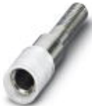
Female test connector, Color: transparent

Female test connector - PSBJ 4/15/6 FARBLOS - 0303419