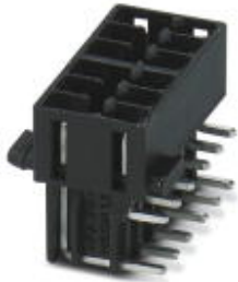
HSC header, touch-proof, 2 units, 12 connections, color: black

Please be informed that the data shown in this PDF Document is generated from our Online Catalog. Please find the complete data in the user's documentation. Our General Terms of Use for Downloads are valid ( http://phoenixcontact.com/download )