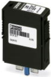
Type 2 surge protection plug with N-PE total current spark gap.

Please be informed that the data shown in this PDF Document is generated from our Online Catalog. Please find the complete data in the user's documentation. Our General Terms of Use for Downloads are valid ( http://phoenixcontact.com/download )