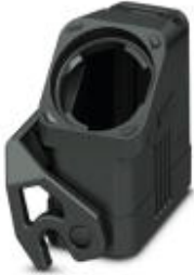
HEAVYCON EVO coupling housing, plastic, with bayonet flange for EVO screw connection, D15, with single locking latch, without EVO screw connection

Please be informed that the data shown in this PDF Document is generated from our Online Catalog. Please find the complete data in the user's documentation. Our General Terms of Use for Downloads are valid ( http://phoenixcontact.com/download )