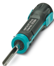
Contact removal tool, for rotated CK-4,0-... contacts

Please be informed that the data shown in this PDF Document is generated from our Online Catalog. Please find the complete data in the user's documentation. Our General Terms of Use for Downloads are valid ( http://phoenixcontact.com/download )