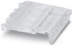
Ejector for COMBICON plug

Please be informed that the data shown in this PDF Document is generated from our Online Catalog. Please find the complete data in the user's documentation. Our General Terms of Use for Downloads are valid ( http://phoenixcontact.com/download )