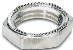
EMV nut, Threads, M12 x 1

Please be informed that the data shown in this PDF Document is generated from our Online Catalog. Please find the complete data in the user's documentation. Our General Terms of Use for Downloads are valid ( http://phoenixcontact.com/download )