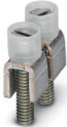
Fixed bridge, Number of positions: 2, Color: silver

Please be informed that the data shown in this PDF Document is generated from our Online Catalog. Please find the complete data in the user's documentation. Our General Terms of Use for Downloads are valid ( http://download.phoenixcontact.com )