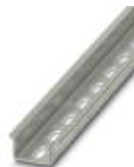
DIN rail, material: steel galvanized and passivated with a thick layer, perforated, height 15 mm, width 35 mm, length: 2000 m

DIN rail perforated - NS 35/15 PERF 2000MM - 1201730