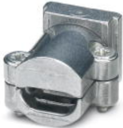
Cable clamp for cable diameter of 5 - 7 mm

Please be informed that the data shown in this PDF Document is generated from our Online Catalog. Please find the complete data in the user's documentation. Our General Terms of Use for Downloads are valid ( http://download.phoenixcontact.com )