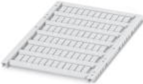
The figure shows the UCT2-TM 5/6 version

Marker for terminal blocks, can be ordered: by sheet, white, labeled according to customer specifications, Mounting type: Snap into tall marker groove, for terminal block width: 5.2 mm, Lettering field: 4.2 x 8.4 mm