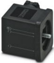
Valve connector, 3-pos., construction A, without protective circuit, screw connection, M16 cable gland

Please be informed that the data shown in this PDF Document is generated from our Online Catalog. Please find the complete data in the user's documentation. Our General Terms of Use for Downloads are valid ( http://download.phoenixcontact.com )