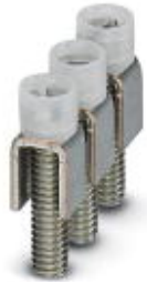
Fixed bridge, Number of positions: 3, Color: silver

Please be informed that the data shown in this PDF Document is generated from our Online Catalog. Please find the complete data in the user's documentation. Our General Terms of Use for Downloads are valid ( http://download.phoenixcontact.com )