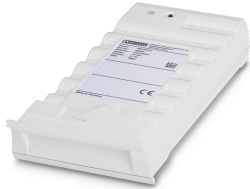
Replacement battery for the THERMOMARK PRIME, NiMH 18 V DC, 2.1 Ah

Please be informed that the data shown in this PDF Document is generated from our Online Catalog. Please find the complete data in the user's documentation. Our General Terms of Use for Downloads are valid ( http://phoenixcontact.com/download )