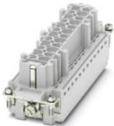
HEAVYCON socket insert, for 830 V (III/3), with 10 N/O contacts and 2 switch contacts, crimp connection

Please be informed that the data shown in this PDF Document is generated from our Online Catalog. Please find the complete data in the user's documentation. Our General Terms of Use for Downloads are valid ( http://phoenixcontact.com/download )