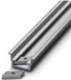
Slide nut, for DIN rail NS 35/15-AL, with M 6 thread, for mounting equipment, material: Steel

Please be informed that the data shown in this PDF Document is generated from our Online Catalog. Please find the complete data in the user's documentation. Our General Terms of Use for Downloads are valid ( http://download.phoenixcontact.com )