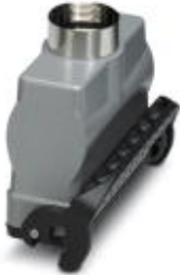
HEAVYCON B24 coupling housing, with single locking latch, height: 80.5 mm, with 1 x M25 gland, straight cable outlet

Please be informed that the data shown in this PDF Document is generated from our Online Catalog. Please find the complete data in the user's documentation. Our General Terms of Use for Downloads are valid ( http://download.phoenixcontact.com )