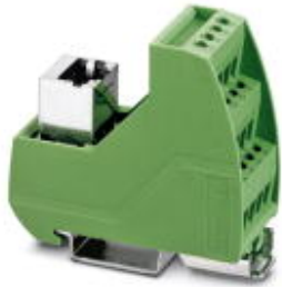
VARIOFACE module with screw connection and RJ45 connector

Please be informed that the data shown in this PDF Document is generated from our Online Catalog. Please find the complete data in the user's documentation. Our General Terms of Use for Downloads are valid ( http://phoenixcontact.com/download )