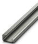
G-profile DIN rail, material: Steel, unperforated, height 15 mm, width 32 mm, length 2 m

DIN rail - NS 32 UNPERF 2000MM - 1201015