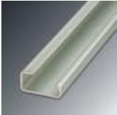
G rail 32 mm (NS 32)

DIN rail - NS 32 AL UNPERF 2000MM - 1201028