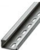
G-profile DIN rail, material: Steel, perforated, height 15 mm, width 32 mm, length 2 m