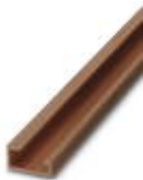
G-profile DIN rail, deep-drawn, material: Copper, unperforated, height 15 mm, width 32 mm, length 2 m

DIN rail - NS 32 CU/120QMM UNPERF 2000MM - 1201280